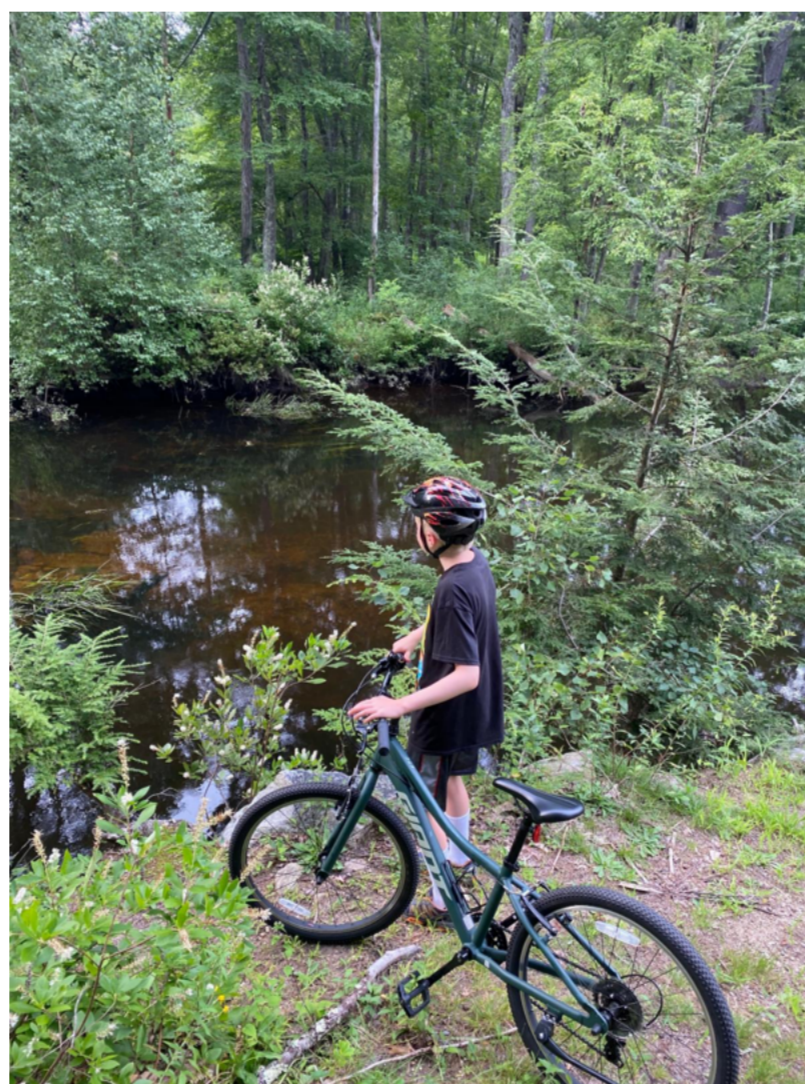
The remains of the old bridge over the Squannacook River, which was washed away in 1938.

We have begun the process of permitting this project. There are a number of permitting challenges so we cannot guarantee this project will move forward, but we can promise we will do everything we can to bring make the Meehan Bridge a reality, in order to make our area safer for bicycling and walking.