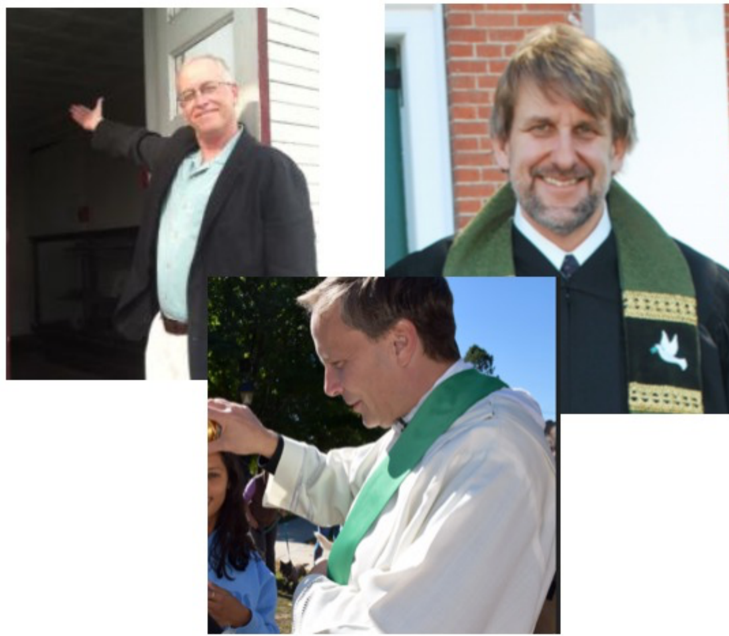
Co-sponsored by Townsend Congregational Church, St. John the Evangelist Church, New Beginnings United Methodist Church, and Squannacook Greenways