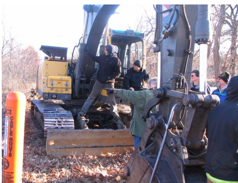
Look for more volunteer days in 2019 before planned construction begins in November!

After we complete the permitting process, we will need lots of volunteers! First, we'll need help clearing brush and trees from the rail corridor—a big job! Next, we'll install erosion control barriers to protect the resource areas. We'll use straw-filled tubes known as "wattles" that we'll stake down in designated areas. So keep an eye out for more events coming before construction begins in November 2019.