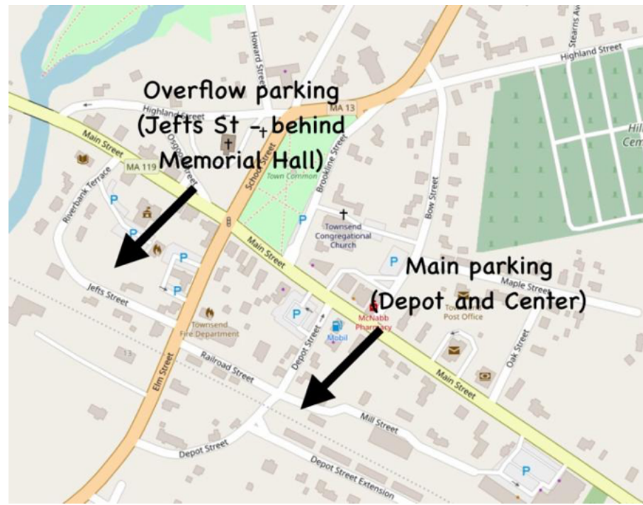
Park at the beginning of the rail trail in Townsend center

Three churches in Townsend center and Squannacook Greenways are co-sponsoring an ecumenical Earth Day clean up of the rail trail on Saturday April 27, 2019. Please come at 9:30 am to the corner of Depot and Common St (overflow parking behind Memorial Hall off Jeffs St.). After an ecumenical opening prayer, we will walk and clean together from there to Harbor Church (1.8 miles). We will follow the Squannacook River Rail Trail, planned for construction this fall. Trash bags and transportation back to the beginning will be provided. Please bring gloves and bug spray. The entire family is welcome! We will be done by about 11, so there will still be plenty of time to attend Earth Day on the Common. Co-sponsored by Townsend Congregational Church, St. John the Evangelist Church, New Beginnings United Methodist Church, and Squannacook Greenways. Everyone, church member or not, is welcome!